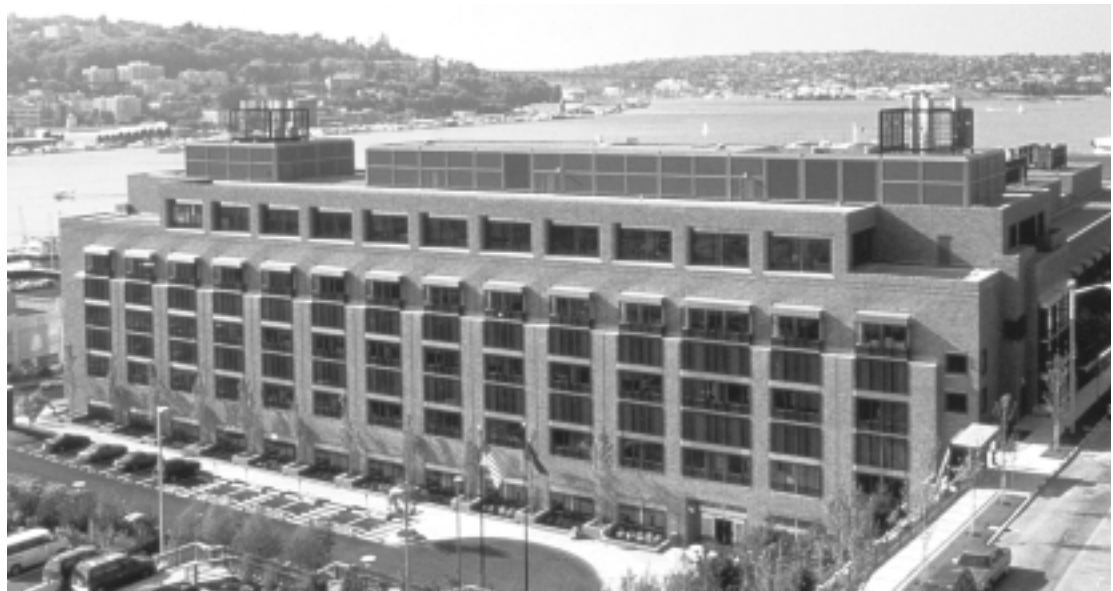
Eckert and Eckert/PIX03055