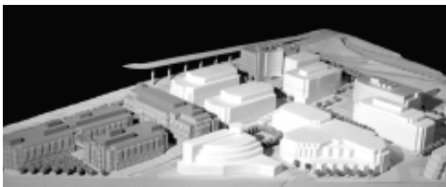
Model showing completed buildings and planned build-out.

of the Center’s scientists have affiliations. The urban, academic campus consists of interrelated yet separate buildings that can stand alone, but are connected aesthetically to future phases. Phase 1 was completed in 1993 and Phase 2 was completed in 1997. Phase 3, the Seattle Cancer Care Alliance Ambulatory Care Building, was completed in January 2001. The last phase of construction should be completed in 2004. This will finalize consolidation of all scientific divisions on a common campus.