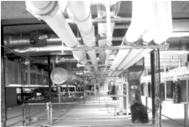
Interior view showing interstitial space.

The study compared cost data on the Thomas building construction with cost data on eight other laboratory buildings. No one conducting the study knew which buildings used interstitial design. The Thomas building hard-construction costs were within 1% of the lowest project cost. For combined hard and soft costs, FHCRC was 18% lower in overall costs against eight other conventional lab projects. A separate study also showed that from an