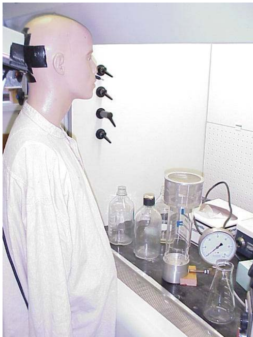
Fig. 7 – Same as Fig. 6, long view.