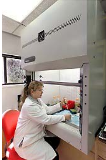
Fig 2 – Lab Manager using the Berkeley hood.