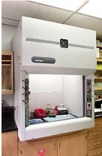
Fig. 1 – Berkeley hood installation at UCSF Medical Center

Figures 1 and 2, of the Berkeley hood, are at the UCSF Department of Pathology, Scanning Electron Microscopy and Cardiovascular facility.