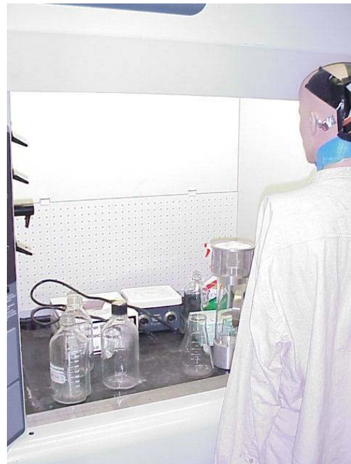
Fig. 8 – Tracer gas test setup for as used (AU) challenge with clutter, right position.