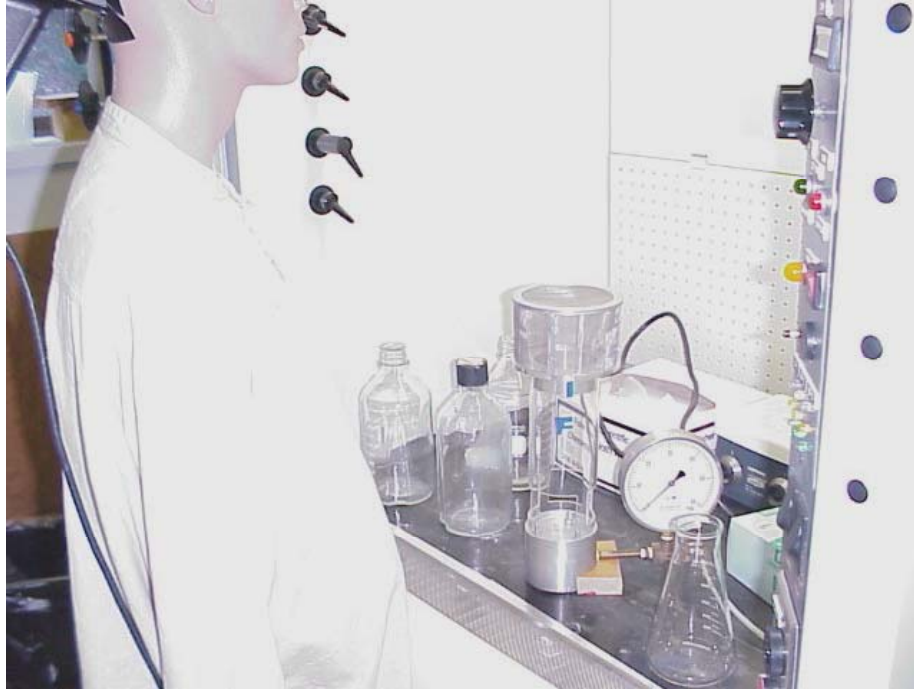
Fig. 6 – Tracer gas test setup for as used (AU) challenge with clutter, center position.