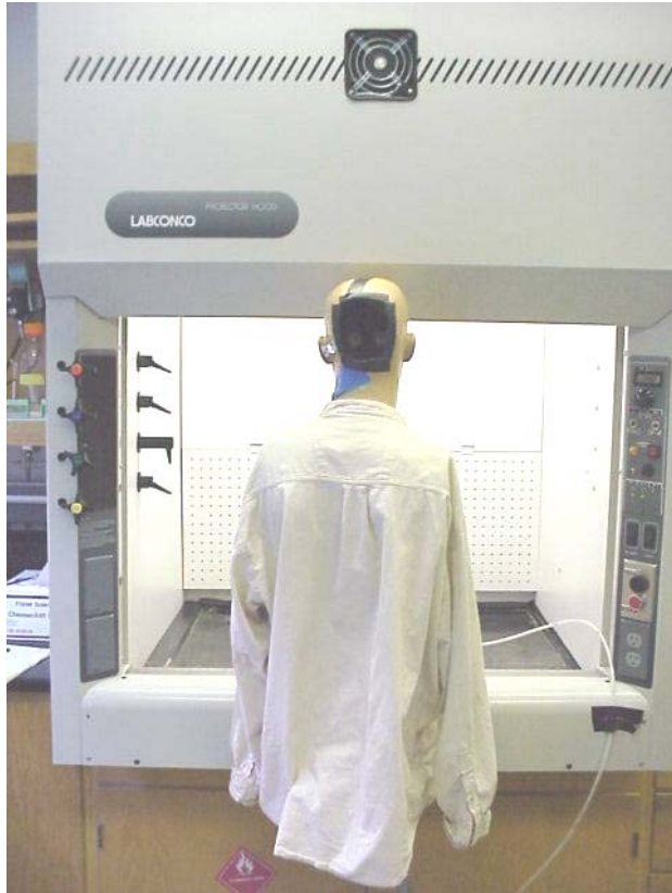
Fig. 3 – Mannequin position for standard ASHRAE 110 SF6 test; 26 inches above, Center.