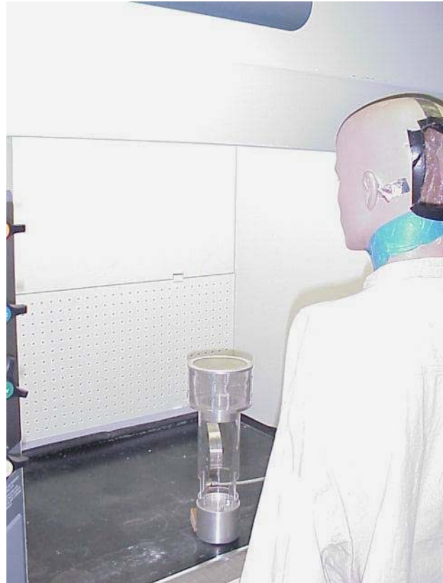
Fig. 4 – Ejector center position for standard ASHRAE 110 SF6 test.